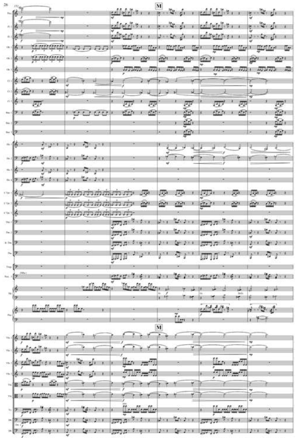
Nature Symphony, I. Mountain of Butterflies (2017)